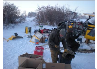
Top Right: Taking the plane apart prior to transporting it back to the MARC hangar.