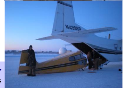
Bottom right: Loading the plane onto the Casa.