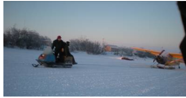
Above: Towing the plane to a safe work area with a snow machine.

Recently, two of our mechanics had an opportunity to help another Christian organization recover an airplane which had crash landed. Here are a few pictures from that adventure!